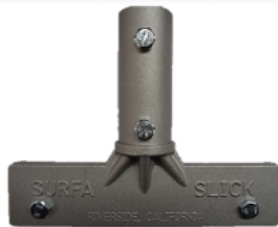
Lute Bar Holder 1¼" or 1½"